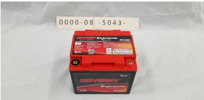
Odyssey Battery - 0000-08-5043

Please be advised that all the previously supplied Battery Tender Batteries will not be allowed in the 2021 Mazda MX-5 Cup Series. The only Homologated battery for the 2021 Mazda MX-5 Cup Series is the Odyssey Battery. Please see below for the parts needed to upgrade to the Odyssey Battery and Battery Tray.