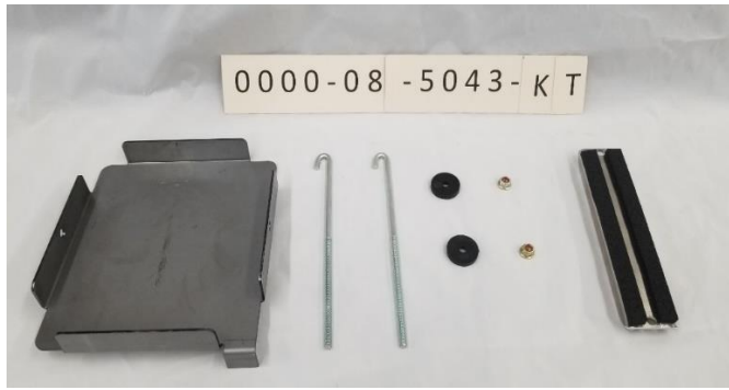
Upgrade Battery Kit 0000-08-5043-KT

If you have any questions or concerns, please contact us: