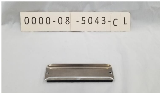
New Battery hold down 0000-08-5043-CL