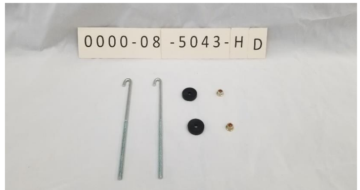
Hold Down Hardware 0000-08-5043-HD